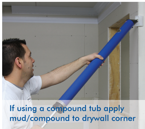
If using a compound tub apply mud/compound to drywall corner

Use #460 Quad Roller or a mud knife to press into place