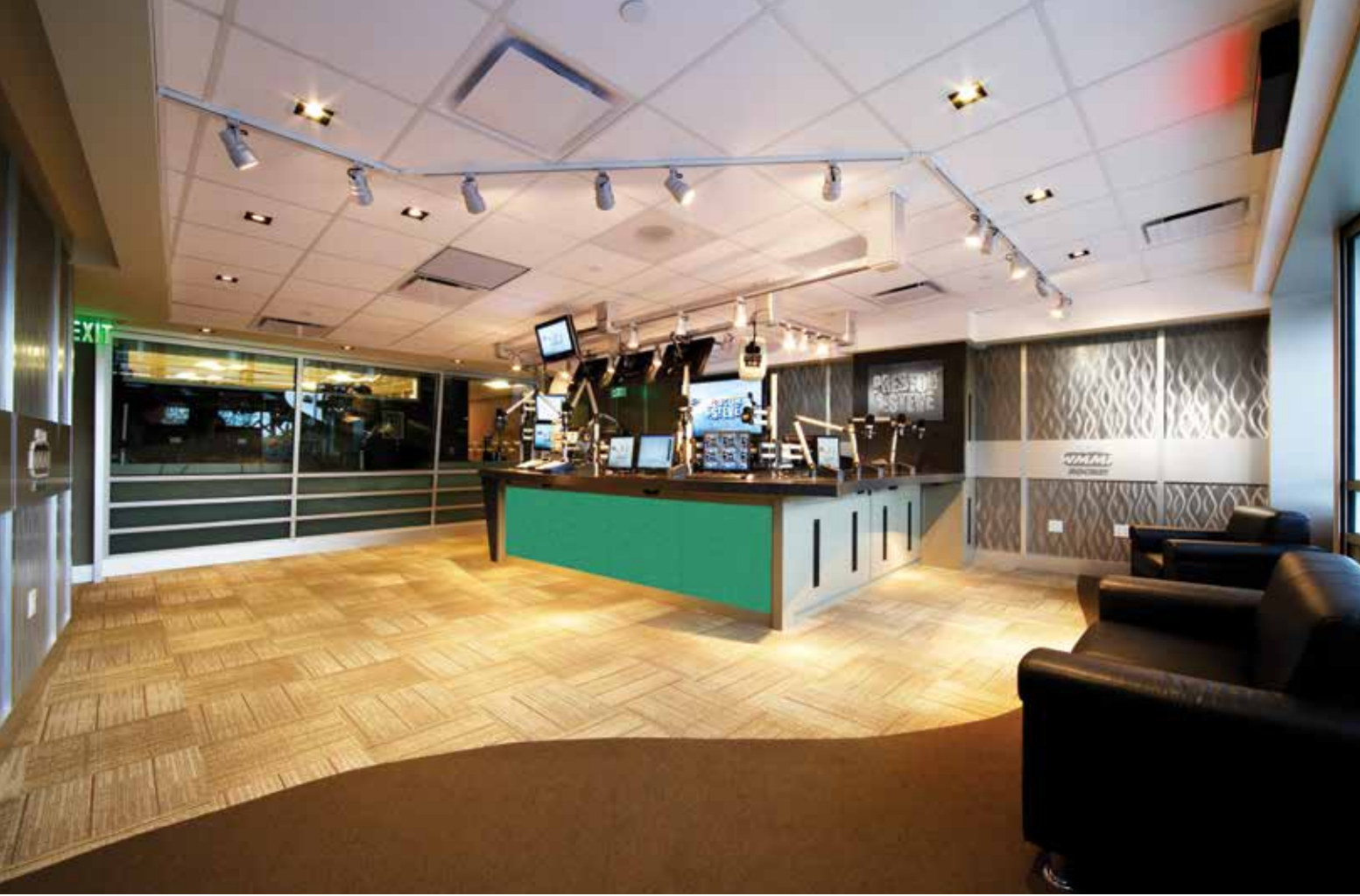
Adagio® Trim (HCAC 1672-IOF-1)