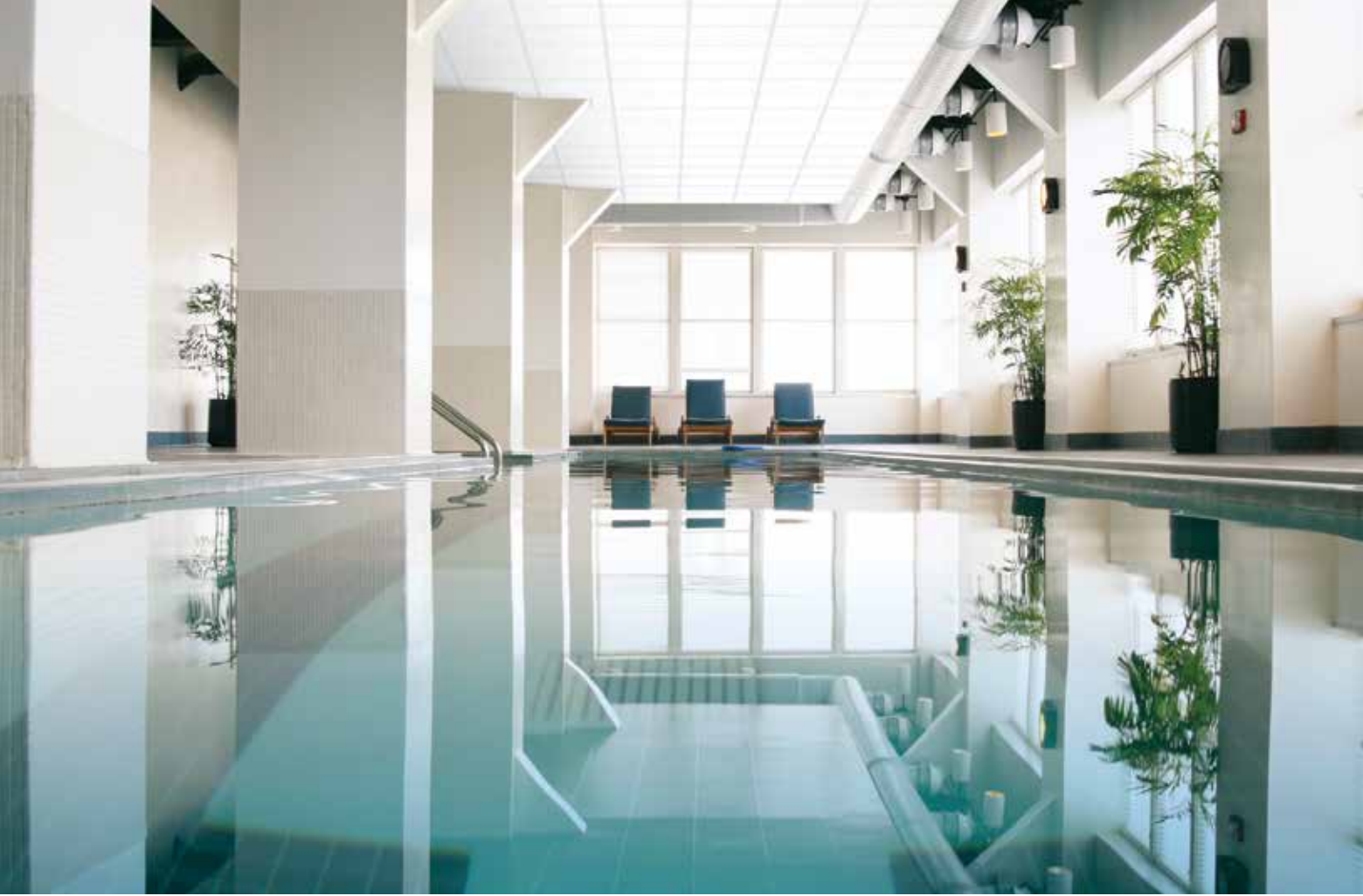
Aquarock™ Trim (1182-CRF-1SV)