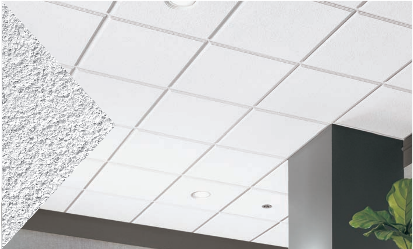
Cirrus® Classic Step™ panels with Suprafine® 9/16" suspension system (Pgs. 400-401)

These medium-textured ceiling panels feature Total Acoustics® performance with a variety of dimensional edge details.