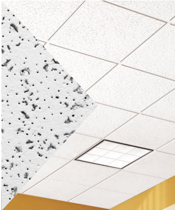
Cortega® Angled Tegular panels with Prelude® 15/16" suspension system (Pgs. 391-392)