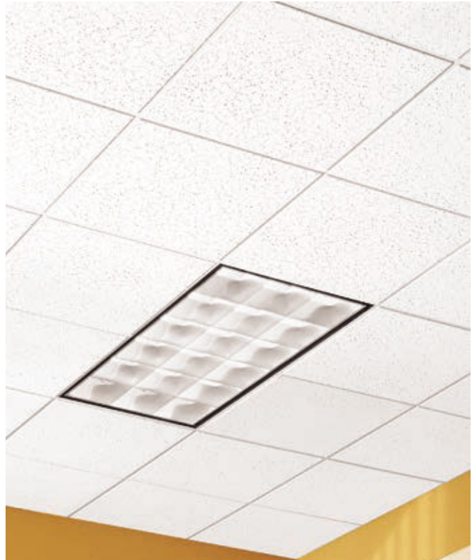
Cortega® Second Look® II panels with Suprafine® 9/16" suspension system (Pgs. 400-401)

Cortega® panels offers a medium-textured, economical solution with standard acoustical absorption.