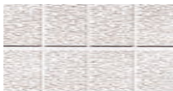
Cortega Second Look I panels – Scoring creates nominal 12" x 12" squares