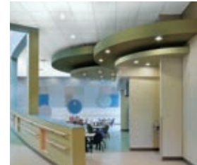
See more photos at: armstrongceilings.com/photogallery SEARCH: mesa

Fine-textured visual with good sound absorption and excellent sound-blocking options. Second Look® items offer a scored visual.