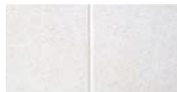
Mesa Second Look® II panel – Scoring created nominal 24" x 24" squares