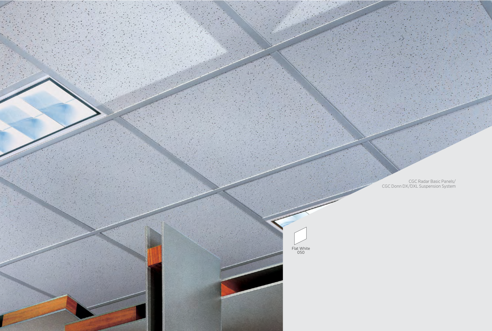
CGC Radar Basic Panels/ CGC Donn DX/DXL Suspension System