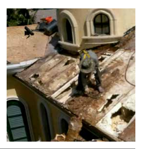
OSB and plywood manufacturers, as well as the Engineered Wood Association, are beginning to provide recommendations to avoid the use of SPF under roof decks due to rot.